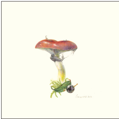
Gomphidius subroseus , Jean Emmons, © 2011, all rights reserved.

Optional: Small battery operated LED task light. There are a variety of light-weight battery operated LED appropriate for our work. A list of suggestions by members will be posted over the summer. Also, consider using long-life rechargeable batteries.